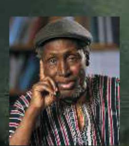
Ngugi Wa Thiong'o